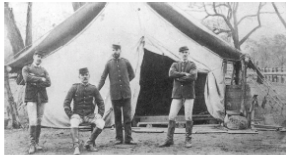
Early days of Wyalong – the Police Station